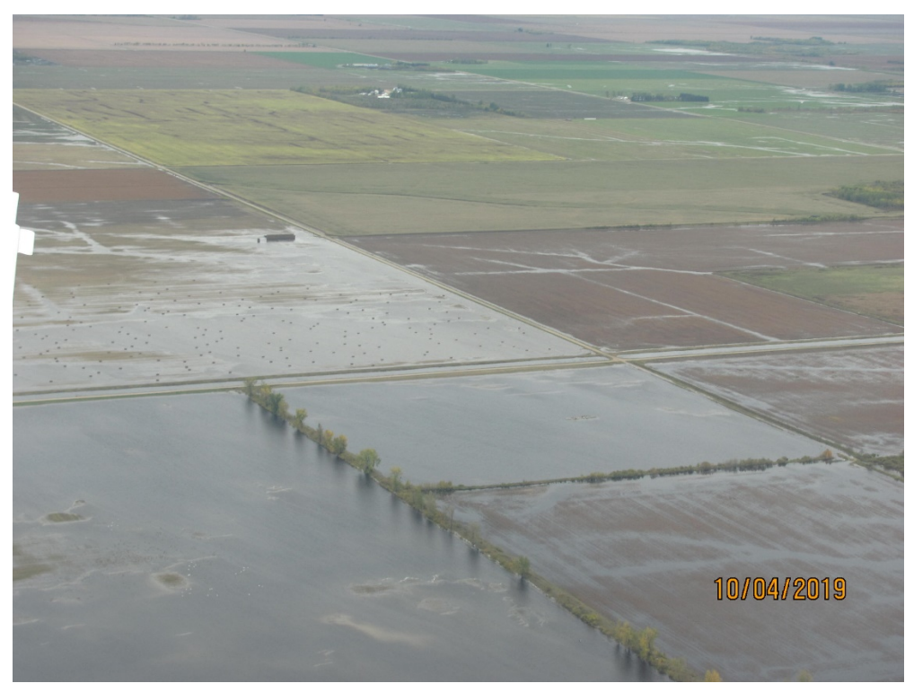
Looking South at Lat 1 SD 95: Sect 6 Barto Twp on left & Sect 1 Polonia Twp on right