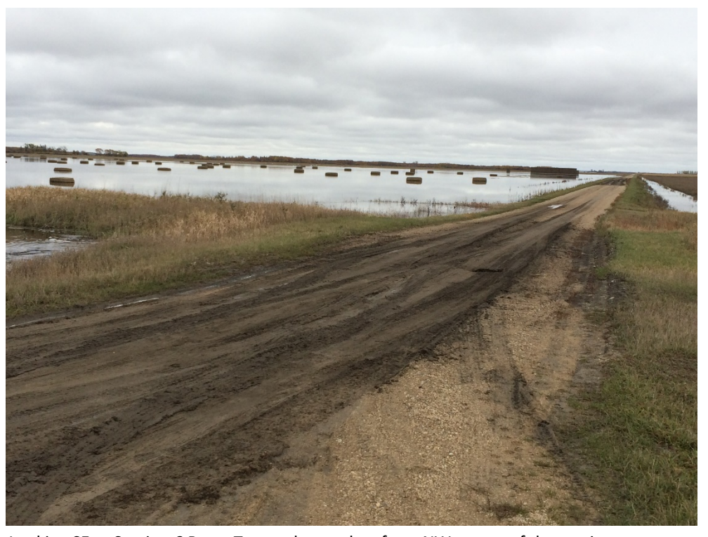
Looking SE at Section 6 Barto Twp – photo taken from NW corner of the section. Diversion will extend 4 miles south from this location